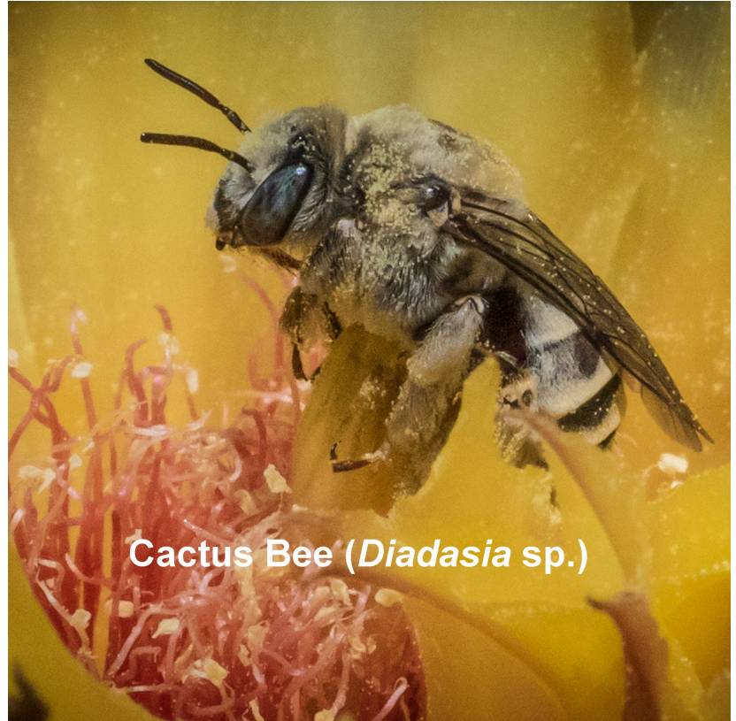
Cactus Bee ( Diadasia sp.)

Sweat Bees also like to visit saguaro flowers!