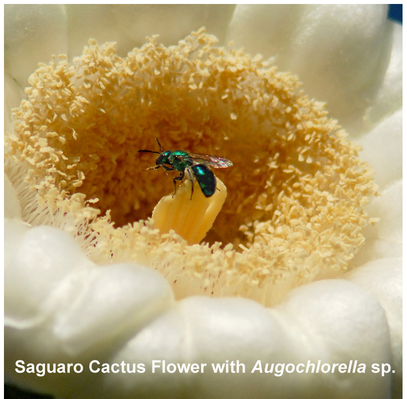
Saguro Cactus Flower with Augochlorella sp.